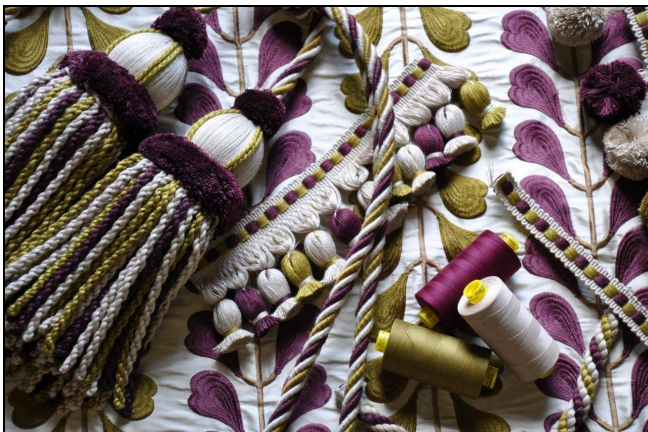
Image of trimming made to match fabric

The company is often commissioned to make copies of trimmings for antique pieces. One recent project involved researching and making pom braid for the Frederick Parker Collection of historic chairs for the Worshipful Company of Furniture Makers in the city of London.